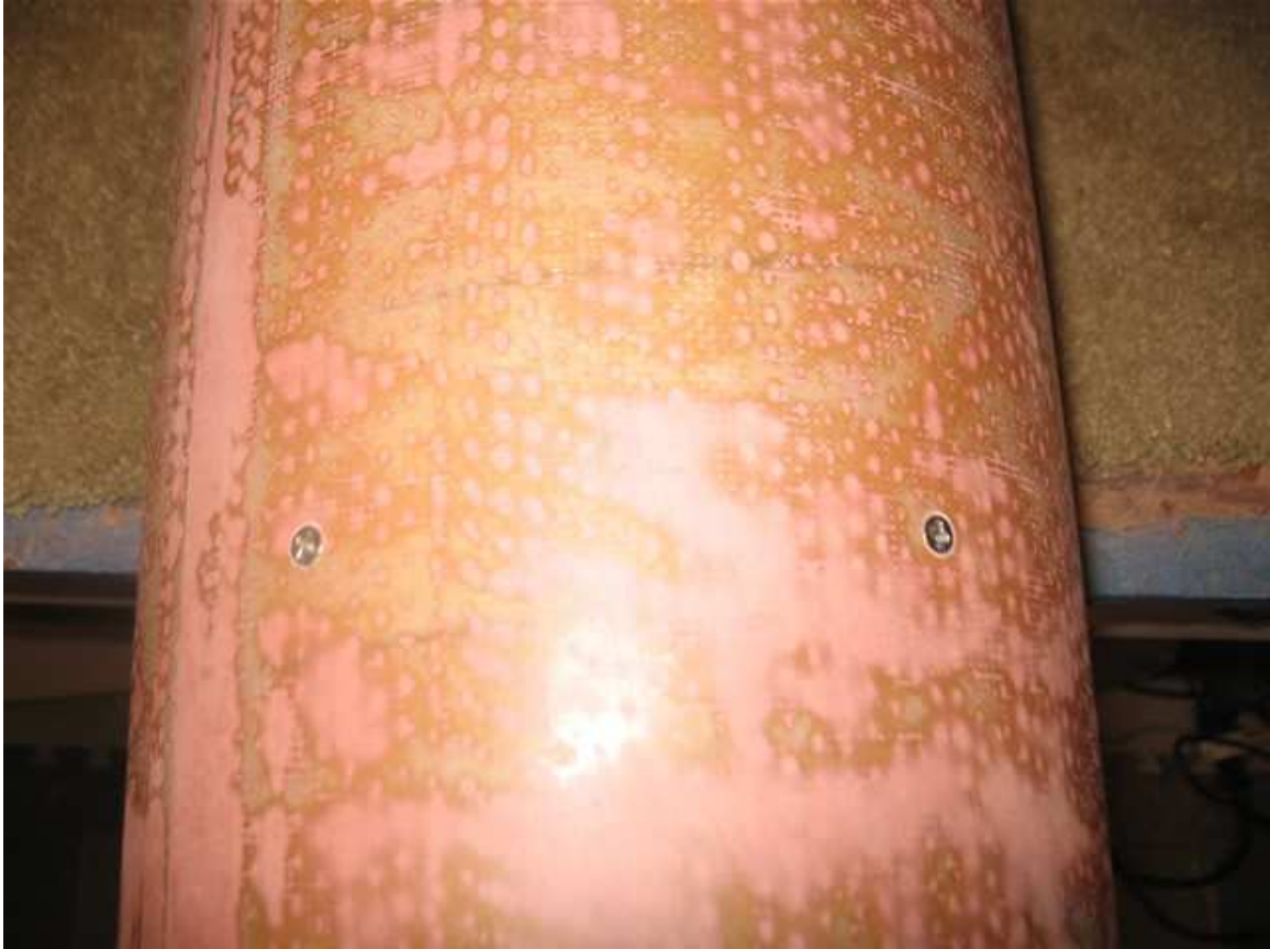
I used six counter sunk 6/32 machine screws for mounting the av-bay to the upper airframe. This shows two of the six screws.